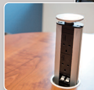
Meeting Table 1.2m diameter circular tabletop finished in stained cherry crown cut veneer with led lit pop-up data power dock