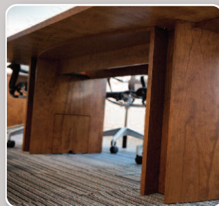
Integral cable management rail and access door