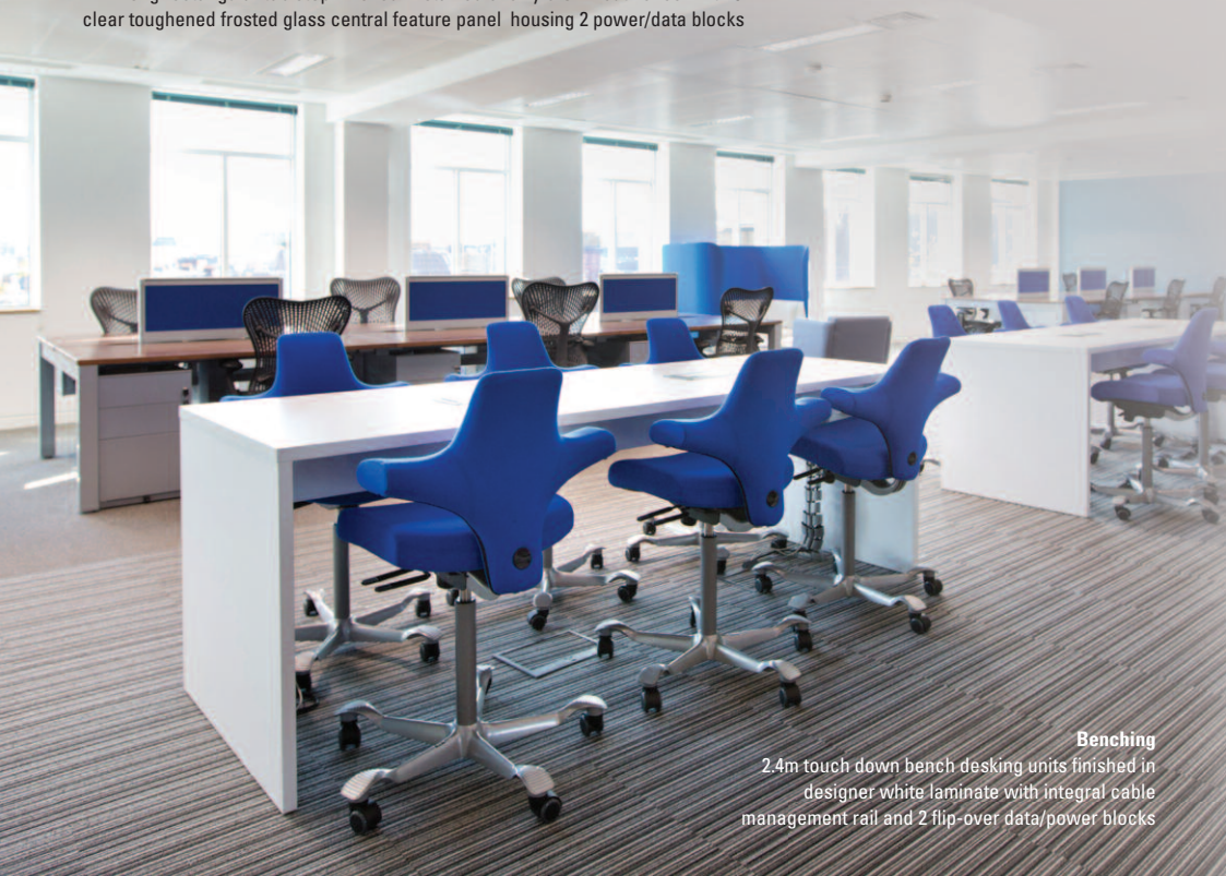
Benching 2.4m touch down bench desking units finished in designer white laminate with integral cable management rail and 2 flip-over data/power blocks